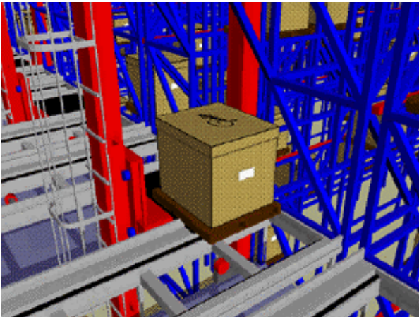
Figure 4: AutoMod 3-D Graphics

Both dynamic and static objects can be displayed during model execution. Figure 4 shows a screen shot of a typical AutoMod model during a model run. Dynamic objects represent loads, resources, queues, and statistics. The static layout is the background graphics of the plant. It may contain column lines, aisle markings, and walls. Labels can identify specific areas in the facility.