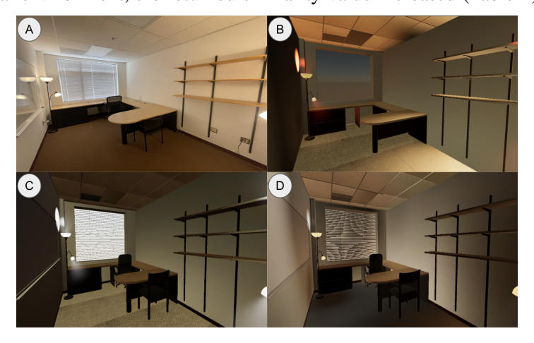
Figure 2: A: Photo of the real-world, physical office space. B: Rendering with missing furniture and incorrect lighting values. C: Rendering with no volumes to reflect light. D: Rendering with optimal volume, furniture, and lighting values.

To validate our digital twin's similarity to our photo capturing the real-world office, we generated three renderings: one with missing furniture and incorrect lighting color via the emission temperature setting, one with no local volumes to reflect, refract, blend light and create shadows, and the final one with optimal volume, furniture, and lighting values. As we enhanced the scene to get the digital twin's lighting to match the lighting of the real environment, the returned similarity value increased (Table 1).