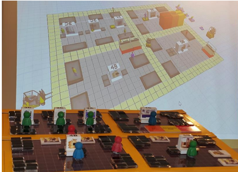
Figure 1: The original state of complete game-case on board and into the simulation 3D model.

Events, make the practical teaching of this basis of Lean philosophy. There is a picture of the game, at this initial stage, on Figure 1 and 2 not yet in the optimized scenario.