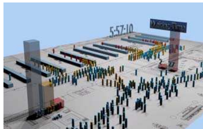
Figure 1: 3D-Model of the simulation

Based on this data, a 3D-animation is created (see figure 1). This animation allows an improved visual analysis of the considered environment of the simulation. Moreover this provides the possibility of moving back and forth in time to facilitate that simulation variances and abnormalities can be recognized and eliminated. Furthermore, individual passenger characteristics can be made visible in the video. For example, waiting times of the individual passengers can be visualized. Passengers, who have a lower than 10 minute waiting time are shown in blue. Persons with a cumulated waiting time of 10 to 20 minutes are marked in yellow and passengers with a waiting time longer than 20 minutes are shown in red.