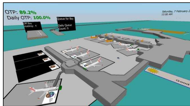
Figure 1 Simulation Model of Virgin Australia's Operation at Melbourne Airport

A picture of the simulation model is shown in Figure 1.