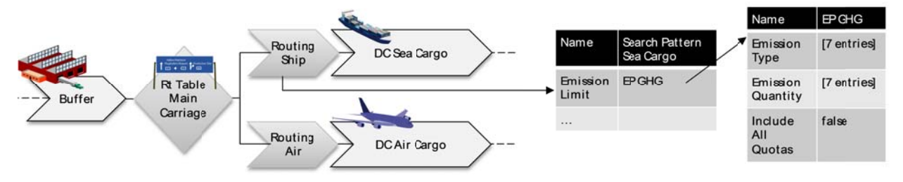
Figure 4: A sample routing concept based on emissions

Figure 4 describes an example for this application. The sketch shows a routing table with two routing entries respectively succeeded by a DC. The ship routing is the first entry and, according to OTD-NET concepts, tested at first. The routing references the "Search Pattern Sea Cargo", which uses the new attribute and class for emissions. The emission pattern object called "EP GHG" contains a list of greenhouse gases and the according quotas that the company is willing to emit. As soon as one emission limit is reached (attribute "Include All Quotas" = false), the emission pattern and, therefore, the search pattern are matched.