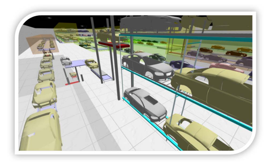
Figure 2: DES model created by students from the Chalmers course.