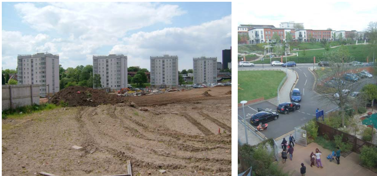
Figure 1: Lee Bank at Attwood Green - Park Central regeneration area 1 , Birmingham, UK. Started as the biggest urban regeneration project in Europe.

Continued urbanisation and growth of cities resulting from processes of globalisation, migration, segregation and polarisation bring greater complexity in the planning and management of cities, posing a threat to the resilience of urban areas. Resilience is an important emerging concept in public policy globally involving the adaptive capacity and coping strategies of social, economic and physical urban systems to withstand change and the ability to anticipate risks at neighbourhood or city level and ‘bounce-back’ from environmental, socio-economic or anthropogenic ‘shocks’ (Adger 2000, Coaffee et al. 2008, Rose 2007). Shocks, whether social, economic, environmental or anthropogenic, affect places in different ways (Figure 1). Translating complexity and its social consequences for neighbourhoods and cities remains a challenge for policymakers as it requires the incorporation of multiple narratives or viewpoints.