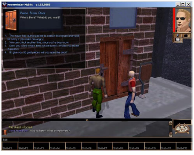
Figure 1: Screen Shot From The Testbed

Characters can move around the world, pick up and use items, go into buildings, read maps and signs, and interact with other characters. Other characters can be player characters (PCs) controlled by other participants or researchers,