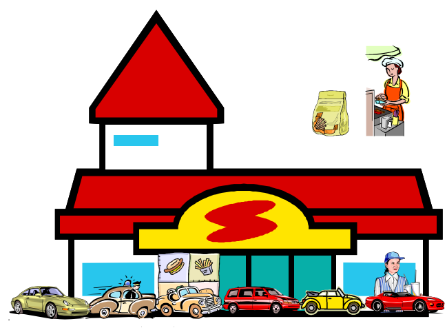
Figure 3: State of the System at Noon

The calendar of this system is made up of the entities that are scheduled to complete an activity with a specific time duration. These entities are Car 1, Car 4, the Order for Car 2, and Car 7. The calendar for these four entities is shown in Table 1.