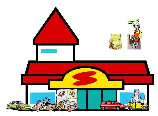
Figure 4: The State of the System at 12:00:40 PM

We also update our statistics at this time. As we described in at time 12:00:20 PM, we look at what has happened since the last time we updated the statistics in order to determine the new values for the statistics. So, what number will we use to calculate the new average number of cars waiting for the Order Window , 2 (the number in line at 12:00:20) or 1 (the number in line now)? The answer is 2 because from time 12:00:20 PM to 12:00:40 PM there were 2 cars waiting in line. The new values for the statistics are shown in Table 6.