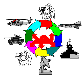
Figure 1: An Example of Dynamic Interaction of Simulation Components

There have been and continue to be a number of attempts at developing inter-model communication standards such as the Department of Defense's High Level Architecture (HLA). Even though this standard is being