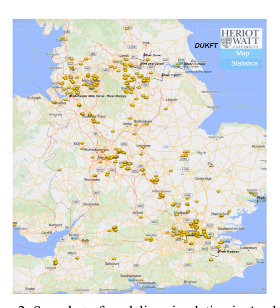
Figure 2: Snapshot of modeling simulation in Anylogic.

is an important step in model development as it can help ensure that the model represents the system and can provide accurate assessment and useful insights. The model cannot be validated because we simulate future scenarios without real-world data, which is a common challenge in modeling future scenarios. However, we establish baseline scenarios using diesel-powered vehicles and compare them to scenarios involving battery HGVs and hydrogen-powered HGVs in road freight. In this comparison, we aim to assess the magnitude of benefits associated with the adoption of battery HGVs and hydrogen-powered HGVs relative to the baseline scenarios.