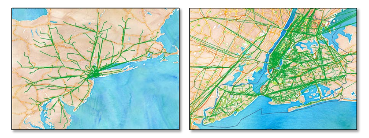
Figure 3: Commuting Simulation around the NYC.