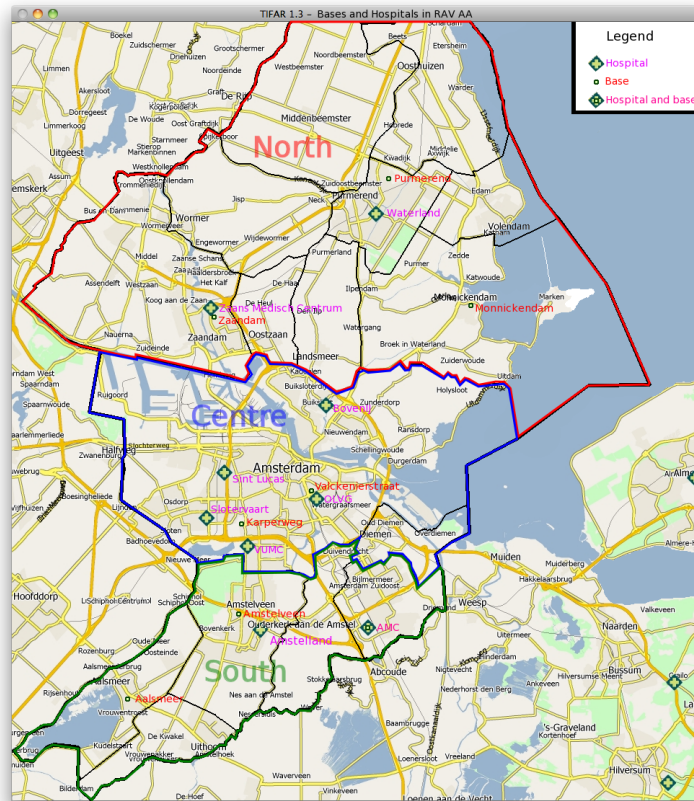
Figure 2: Illustration of Amsterdam region with EMS bases and hospitals.

the system gets calculated, and how they perform output. The visual mode uses a GUI for output and the internal computer clock to determine the next time in which the current system state gets calculated. In this way one can see the EMS movements at real time, or with a speed factor. The speed simulation mode is a discrete event simulator that holds an ordered list with the end times of all currently ongoing events. For example: At the moment when an EMS vehicle departs, we can calculate the moment when the vehicle arrives. This gives a new end time. An end time enters the list when a call enters the system, when a vehicle departs from a location or when a vehicle arrives at a location. The next time at which the state of the system must be calculated then equals the first one in this ordered list. When a predetermined end time has passed, speed simulation mode terminates the program and displays statistics in the terminal. Speed simulation mode is faster than visual mode, because the renewal loop only gets called at necessary time stamps. For each of the two modes there is a separate main loop included in the program.