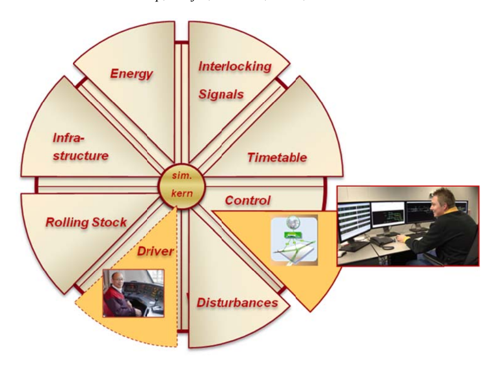
Figure 1: Modeling elements FRISO.