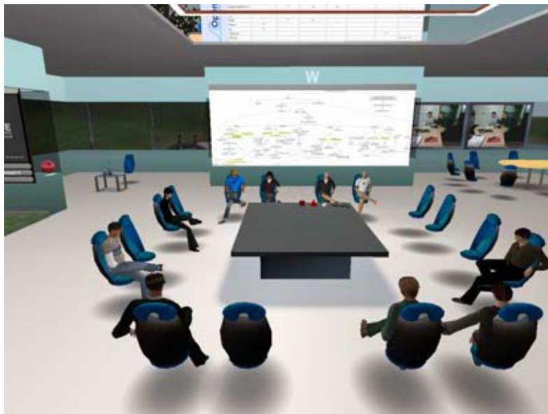
Figure 2: CMap Presentation to SAS-074 Members using a Virtual Collaborative Environment

Currently JFCOM is working with University of Edinburgh in a SL environment testing how PMESII analysis tools, M&S or decision-making systems may present their information in some useful way into this 3D space to be shared by the COI. Some initial collaborative workshops use SL avatars for this coordination. If it is shown that systems can be effectively used in this manner and mutually shared within the VWCE, then SL or another virtual web 2.0 environment may be considered as a platform for the initial experiment.. Figure 2 shows an initial iterative collaborative workshop using SL and screen shot of a CMap presentation.