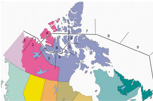
Figure 1: Two Alternate Routes A & B and the Nine Legs

For the Northwest Passage the primary impact of environment on ship speed is ice cover. To model the ice condition and its spatial and temporal variations we divided the Canadian Arctic route into nine legs and fifty weeks. The legs or the spatial grids for the model are depicted in Figure 1. The spatial grid was not kept uniform through out the passage, but was assigned based on regions having contiguous environmental conditions. Historical data on ice regimes in the Canadian Arctic is used to develop probability distributions of ice for each leg of a route through the Northwest Passage; ice conditions are simulated for different times of year. The impact of ice on ship speed is estimated through an ice numeral that indicates the degree of difficulty; it is a function of both type of ship and thickness and type of ice. The ice numeral is correlated to speed.