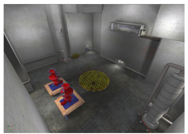
Figure 3: View of Refueling Floor