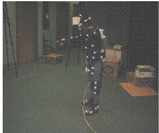
Figure 2: Motion Capture Suit

Motion capture can be defined as the recording of movements by an array of video cameras in order to reproduce the exact image in a digital environment. The three dimensional reproduction has many applications in medical assessment of movement disorders, understanding the techniques used in athletics, creating an imaginary person for movies, videogames, broadcast and web cast, and incorporating motion into virtual environments for engineering design. The motion capture system incorporates all the hardware and software applications for complete control and analysis of motion capture (Tebut, Wood, and King 2002). A participant wearing the motion capture suit and performing the experiment is shown in Figure 2.