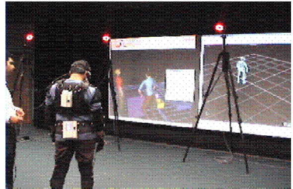
Figure 4: Participant Completely Suited Up

for the observers use only as the participant views the world through the HMD.