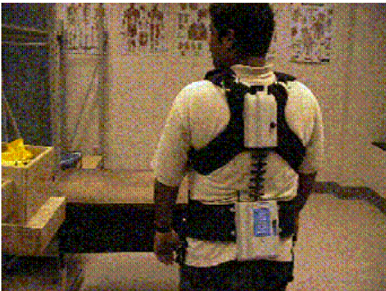
Figure 1: Operator with Lumbar Motion Monitor

The lumbar motion monitor is an exoskeleton of the torso that captures the three-dimensional movement of the thoracolumbar spine. The data recorded by the LMM consists of the position, velocity, and acceleration profiles in all the three planes, the sagittal, transverse and the coronal planes, respectively (Marras et al. 1992). The operator with the equipment is shown in figure 1.